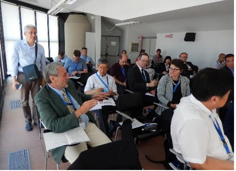
At workshop with CIGR and ASABE (1)

Workshop on the European perspective on ASABE's global initiative was held at the conference.