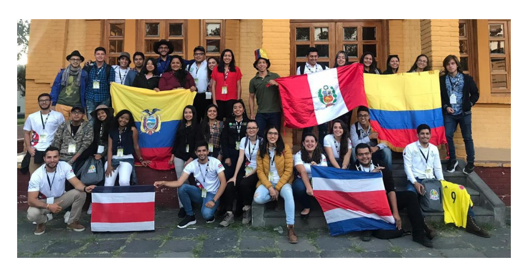
Latin-American and the Caribbean Agricultural Engineering Students attending the X CLEIA at the Chapingo Autonomous University, Mexico.

For more information you can contact the email <u>agricola.acreiab@gmail.como</u> or <u>agricola.aleia@gmail.com</u>