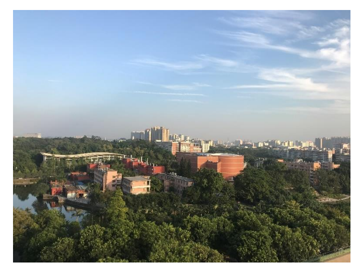
The SCAU campus is 550 hectares with a substantial fraction of green spaces.

South China Agricultural University (SCAU) was founded in 1909 as Guangdong Province agricultural experiments station and Affiliated Institute of Agriculture. It was renamed to its current name in 1984 and holds the rank of Cultivated High-level University. SCAU has approximately 43000 students including nearly 5500 graduate students.