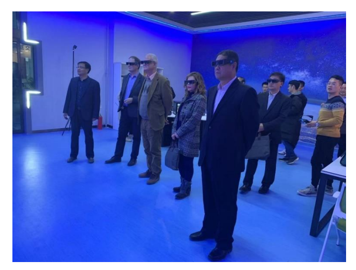
Virtual Reality (VR) teaching facility.