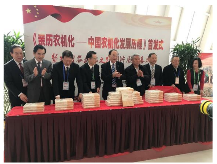
Unveiling of new book on agricultural machinery.