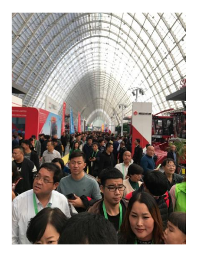
Over 125,000 persons attend CIAME.